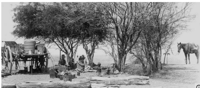
Drover's camp at Hughenden, ca. 1916

The following link will take you to the Office of Fair Trading and further information about these law changes: Office of Fair Trading – Incorporated Associations law changes, July 2024